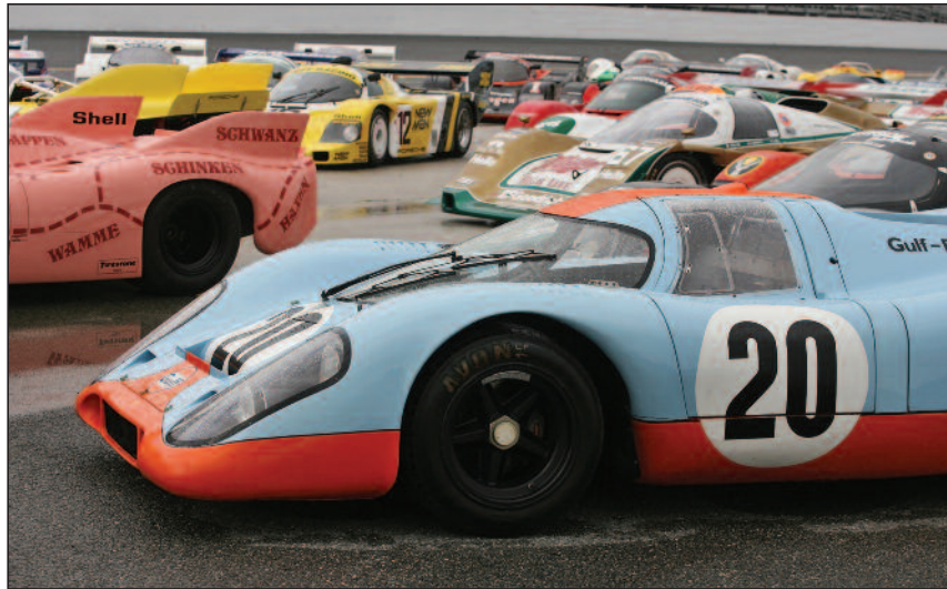
The #20 in the foreground was the Porsche driven by Steve McQueen in the 1970 movie, "Le Mans."