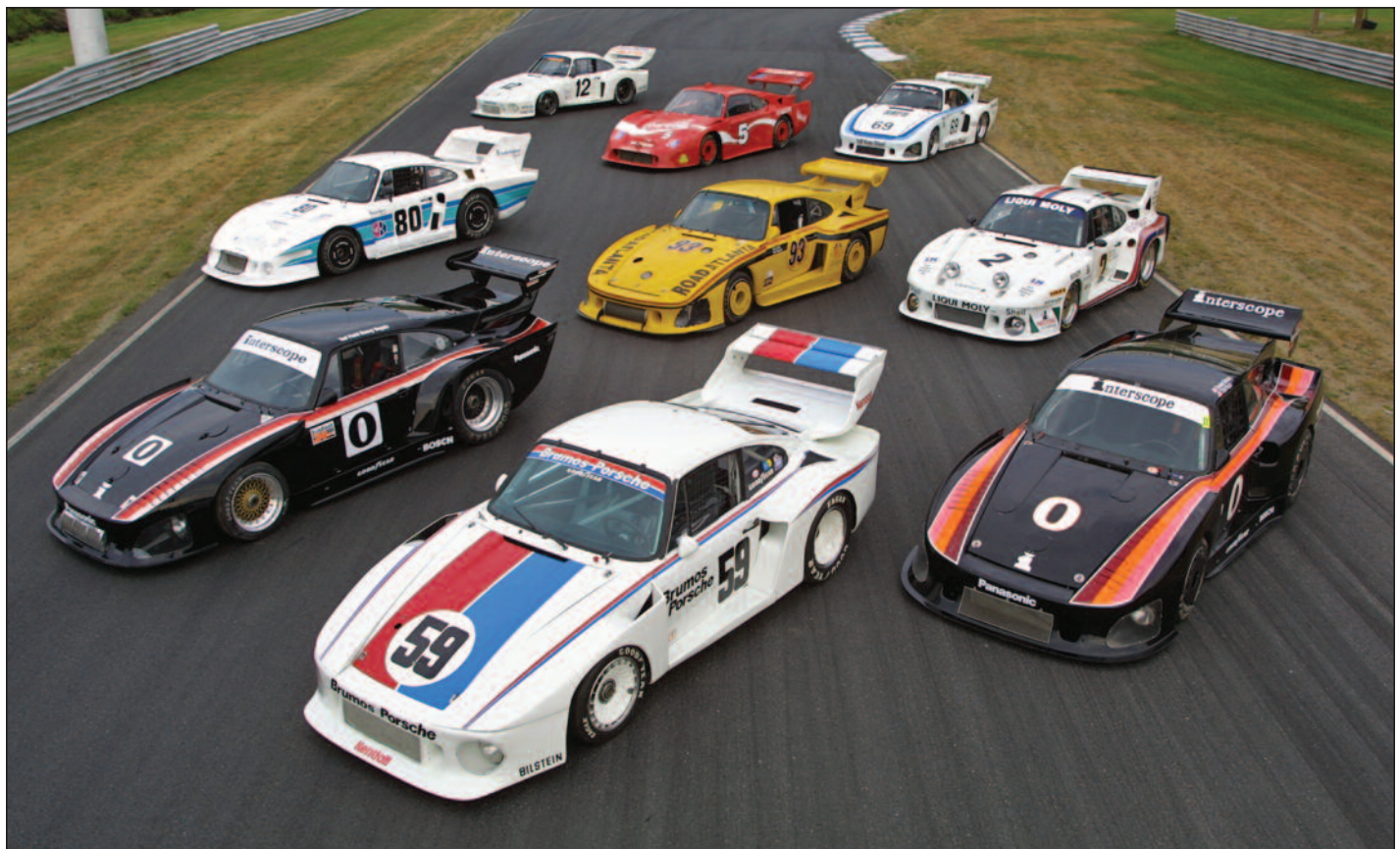
A group of racing Porsche 911s which is the featured model of the Porsche Rennsport Reunion IV, this year held at Mazda Raceway Laguna Seca on October 14th, 15th and 16th.